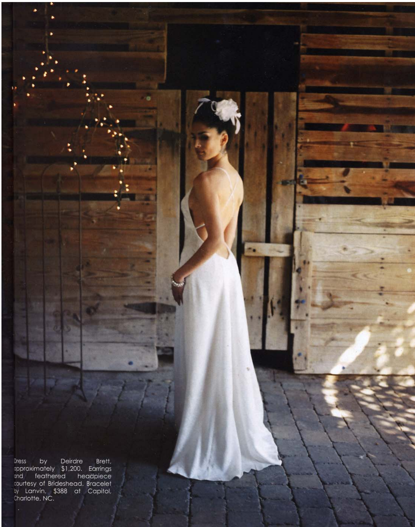
Dress by Deirdre Brett, approximately $1,200. Earrings and feathered headpiece courtesy of Brideshead. Bracelet by Lanvin, $388 at Capitol, Charlotte, NC.