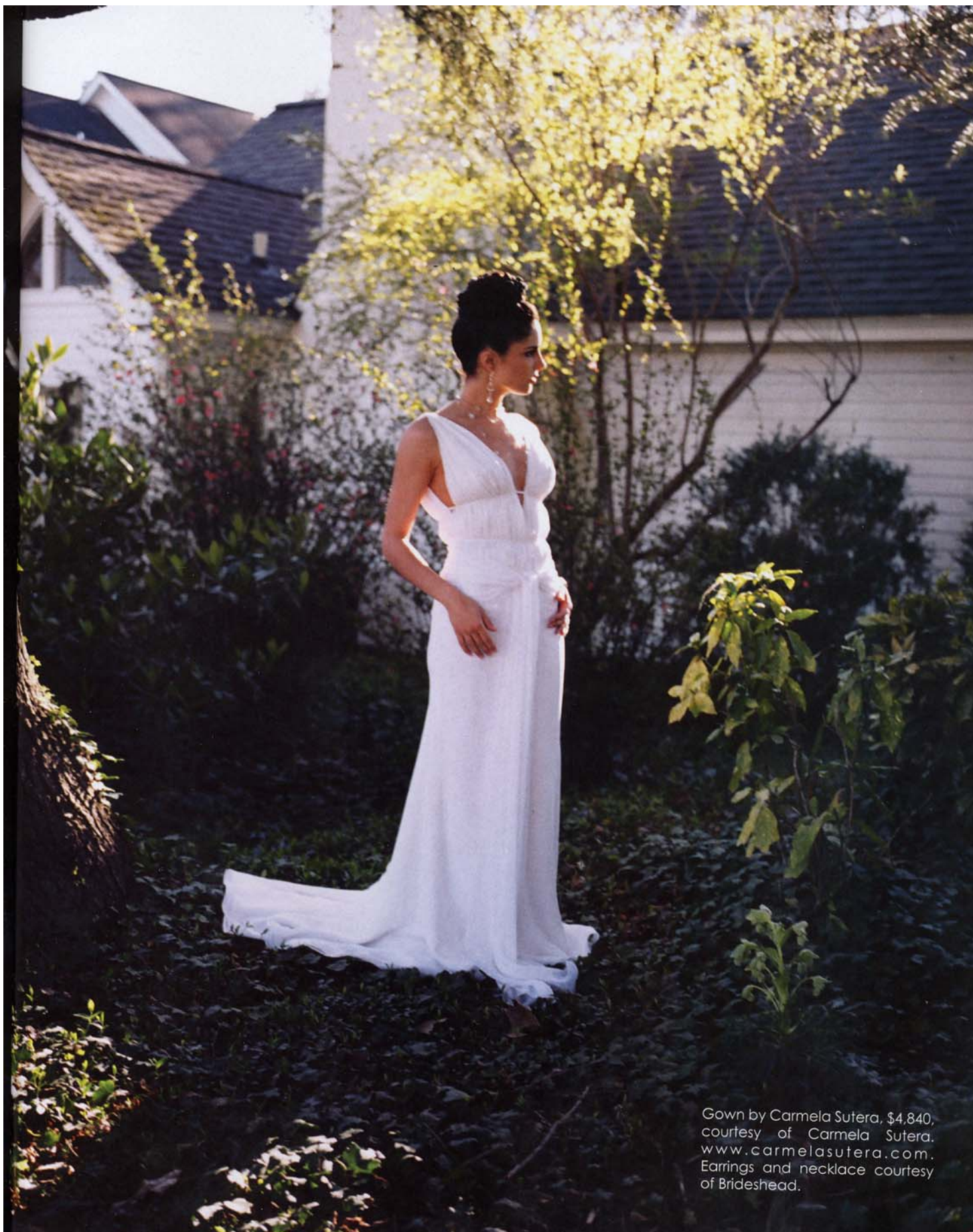
Gown by Carmela Suter, $4,840, courtesy of Carmela Suter. www.carmelasuter.com . Earrings and necklace courtesy of Brideshead.