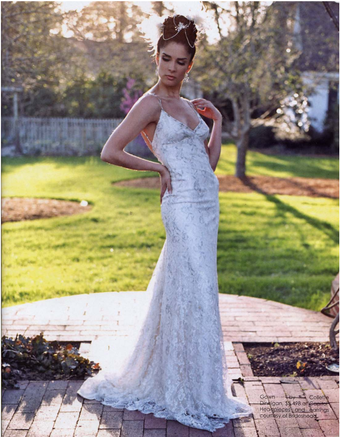
Gown by Collette Dinnigan, $3,498 at Capitol. Headpieces and earrings courtesy of Brideshead.