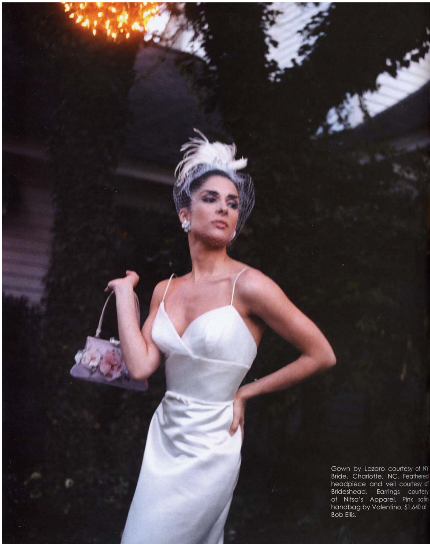
Gown by Lazaro courtesy of NY Bride, Charlotte, NC. Feathered headpiece and veil courtesy of Brideshead. Earrings courtesy of Nitsa's Apparel. Pink satin handbag by Valentino, $1,640 at Bob Ellis.