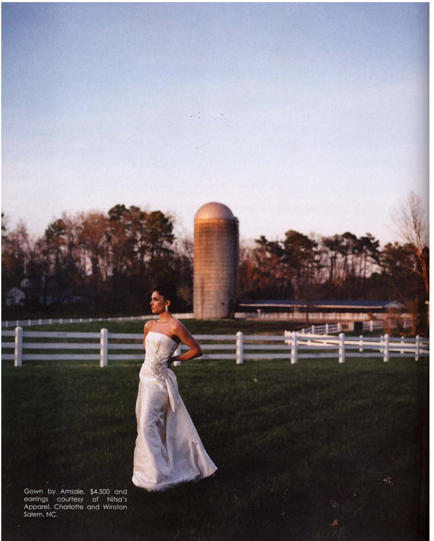
Gown by Amsale, $4,500 and earrings courtesy of Nitsa's Apparel, Charlotte and Winston Salem, NC.