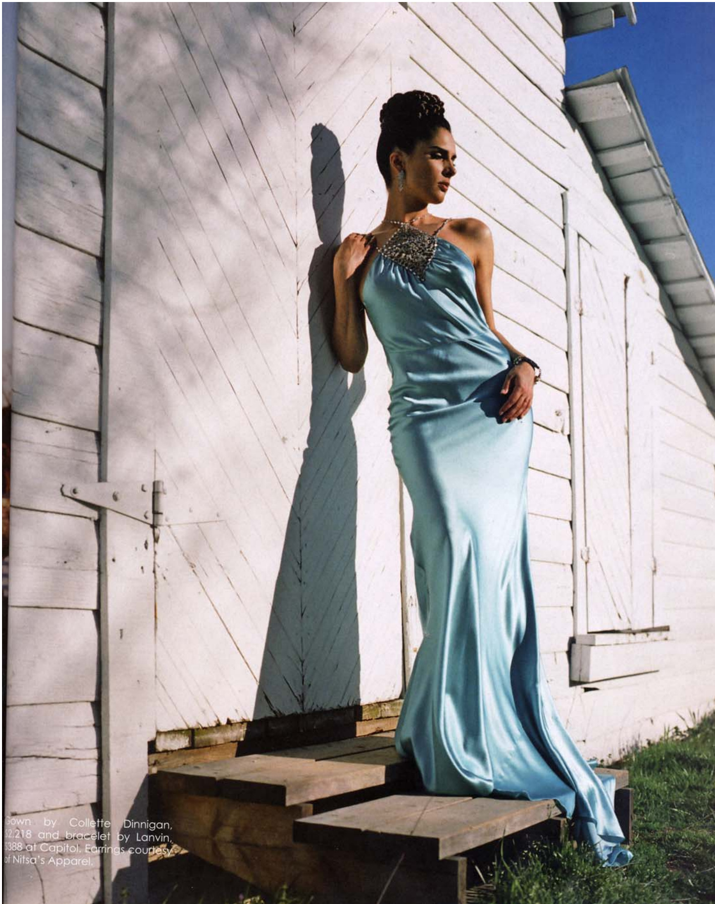
Gown by Collette Dinnigan, $2,218 and bracelet by Lanvin, $388 at Capitol. Earrings courtesy of Nifsa's Apparel.