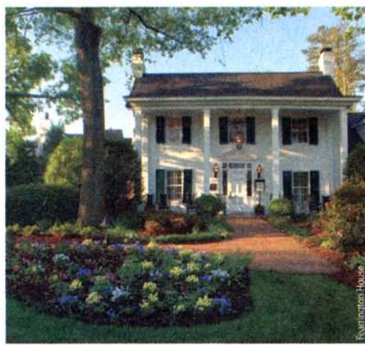
A luxurious home away from home is the feeling you get from a night in Pittsboro's Fearington House. Only the best will do in all aspects of a stay at this beautiful low-country inn. From the plush bedding to the exquisite dining, the Fearington House is the perfect place for a weekend getaway.

This year's proud winners are listed as follows with consecutive years won shown in parentheses: