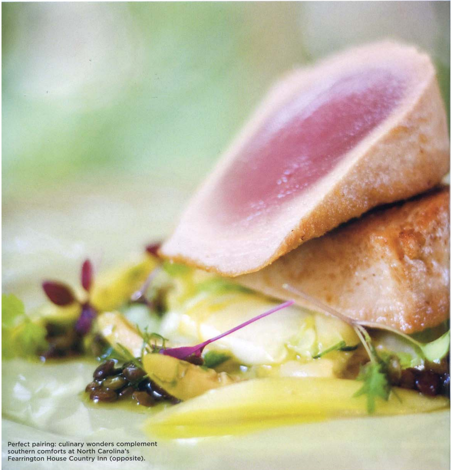
Perfect pairing: culinary wonders complement southern comforts at North Carolina's Ferrington House Country Inn (opposite).