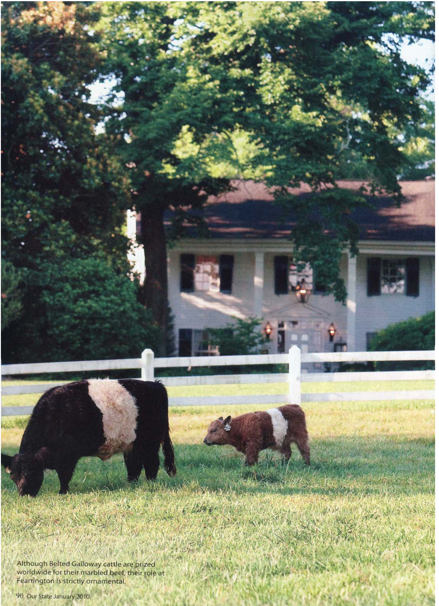
Although Belted Galloway cattle are prized worldwide for their marbled beef, their role at Fearington is strictly ornamental.