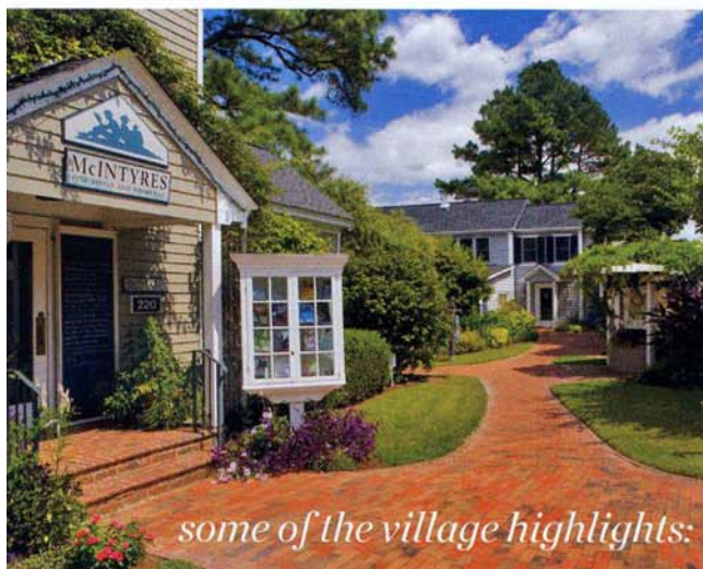
some of the village highlights:

THE BELTED GOAT: Coffee, wine, chocolates, sandwiches, and Beltie memorabilia OLD GRANARY: Full-service dining featuring contemporary American cuisine DOVECOTE: Jewelry, home décor, The Fearington Collection, and art MCINTYRE'S FINE BOOKS: Independent bookstore offering a selection of popular titles, classics, and cookbooks ROOST: A casual courtyard beer garden with nibbles available VIETRI: Handcrafted Italian dinnerware and accessories